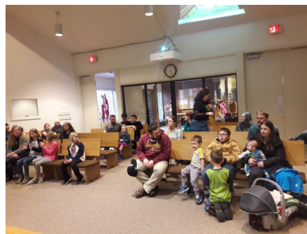
RBL Family Worship, February 26th, 20/20

Jesus said, "Let the little children come to me, and do not hinder them, for the kingdom of heaven belongs to such as these."