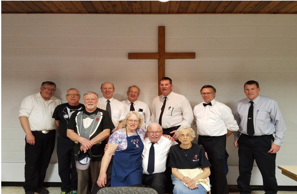
Men's Walleye Fish Dinner