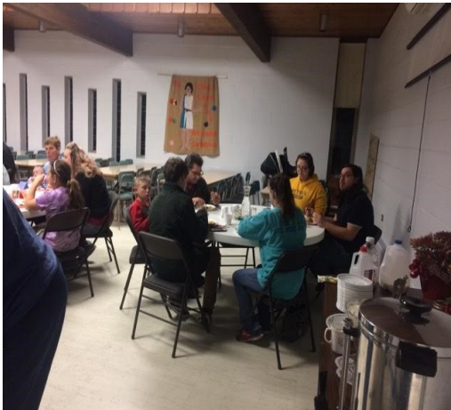
Java & Jesus

29 th – UMW Sunday & Change Shaker Sunday