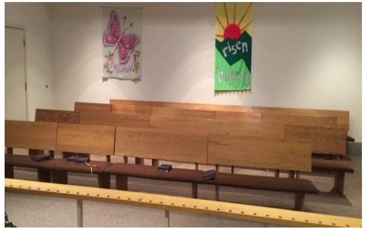
Men's Group Cleaned Carpets

High Rise Meal, Thursday, May 19 th at 11:30am